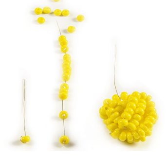
Step 2: String the pressed Spike bead (S) onto a new

First create the head. Prepare 1 m or wire and string about 36 cm of R10 onto it. Secure the beginning of the stringing by passing the wire back through one of the outer rocailles. Twist the wire with the strung seed beads into a small ball which you should strengthen and secure by passing the remaining free wire through it. When passing the wire through the seed bead ball, it is possible to improve the resulting shape by adding further R.