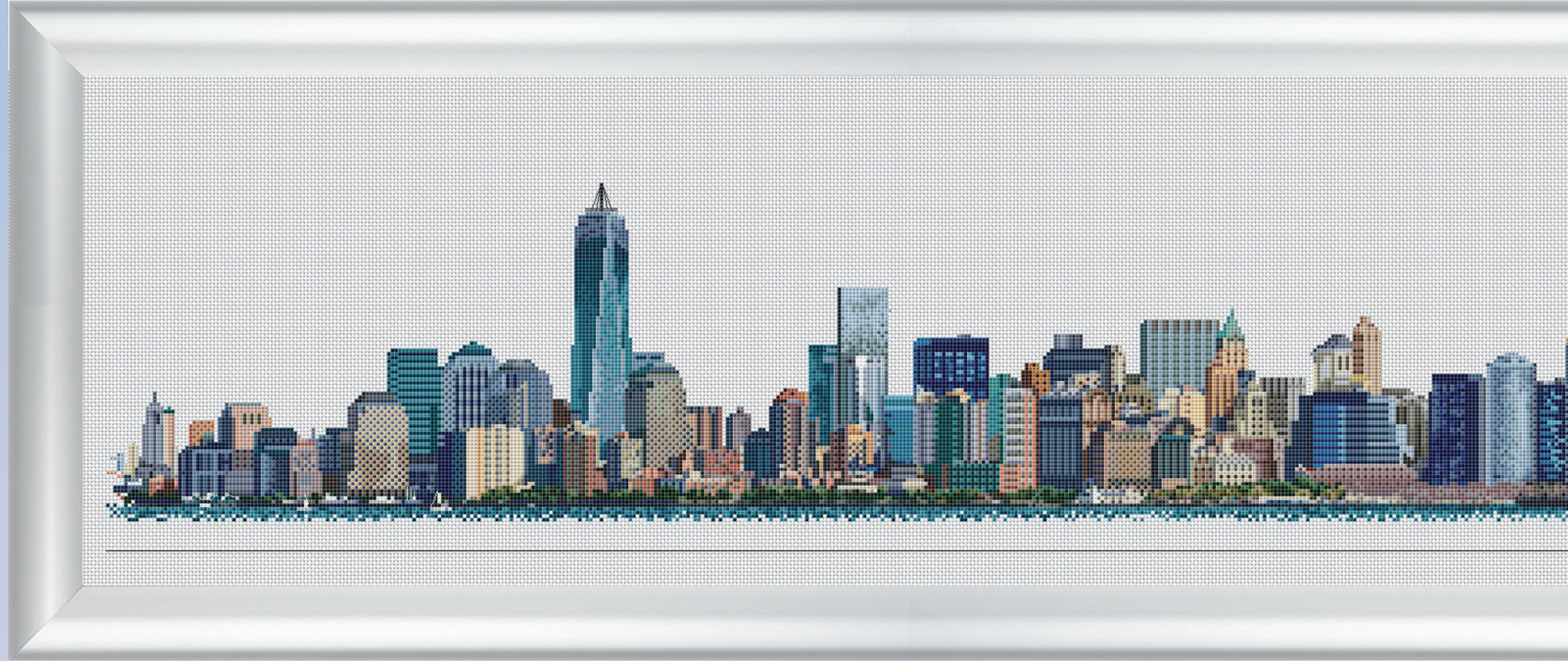
602 New York 20x45CM / 8x18 Inch