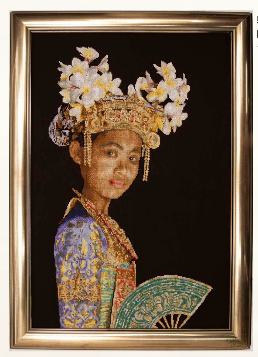
597.05 Balinese Dancer 40x55CM / 16x22 Inch