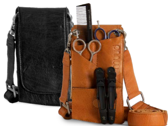
jazz scissor pouch