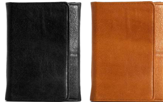
space scissor clutch