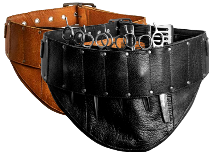
moon scissor belt