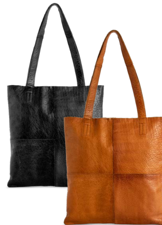
show medium shopper