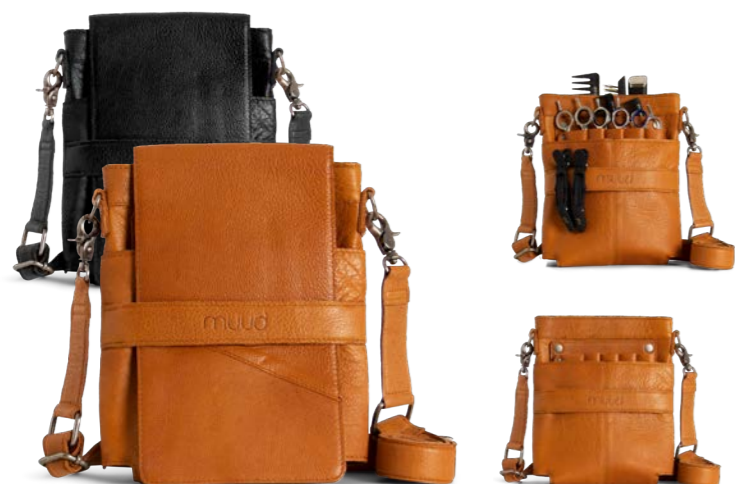
neptun scissor pouch