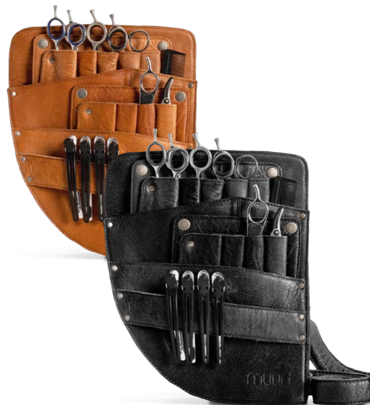
storm scissor pouch