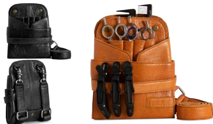
rain scissor pouch