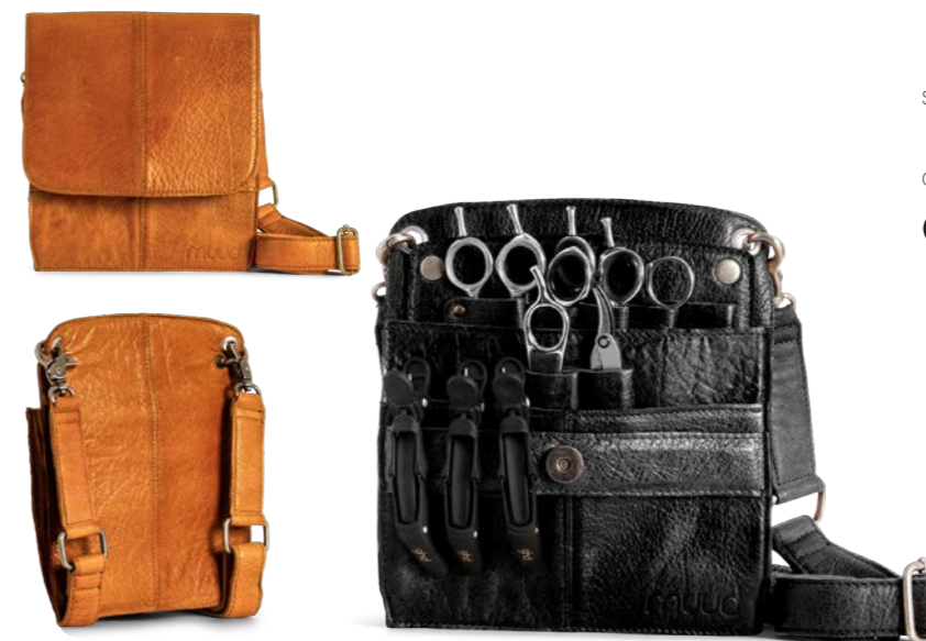
star scissor pouch