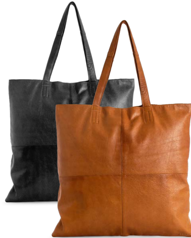
show large shopper