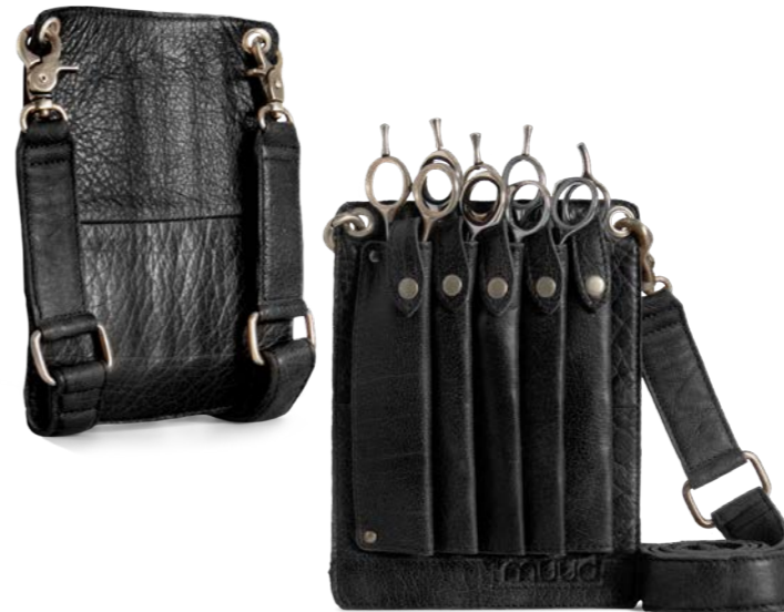
universe scissor pouch