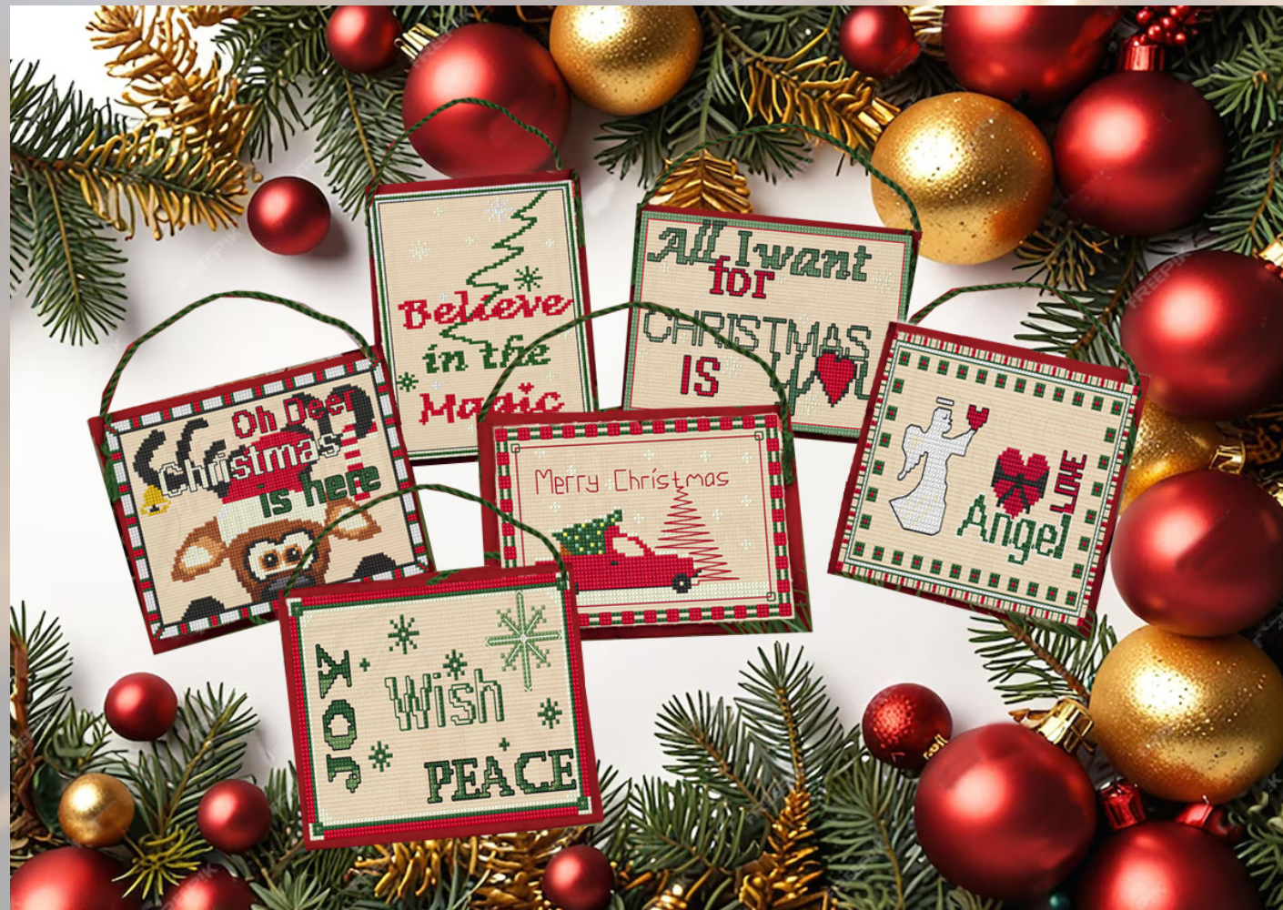
DSB052 Set of 6 Ornaments All finishing materials included