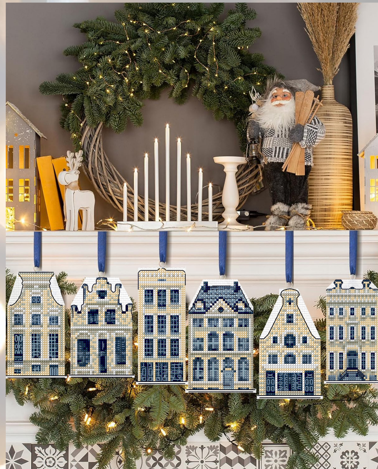
608 Set of 6 Ornaments All finishing materials included