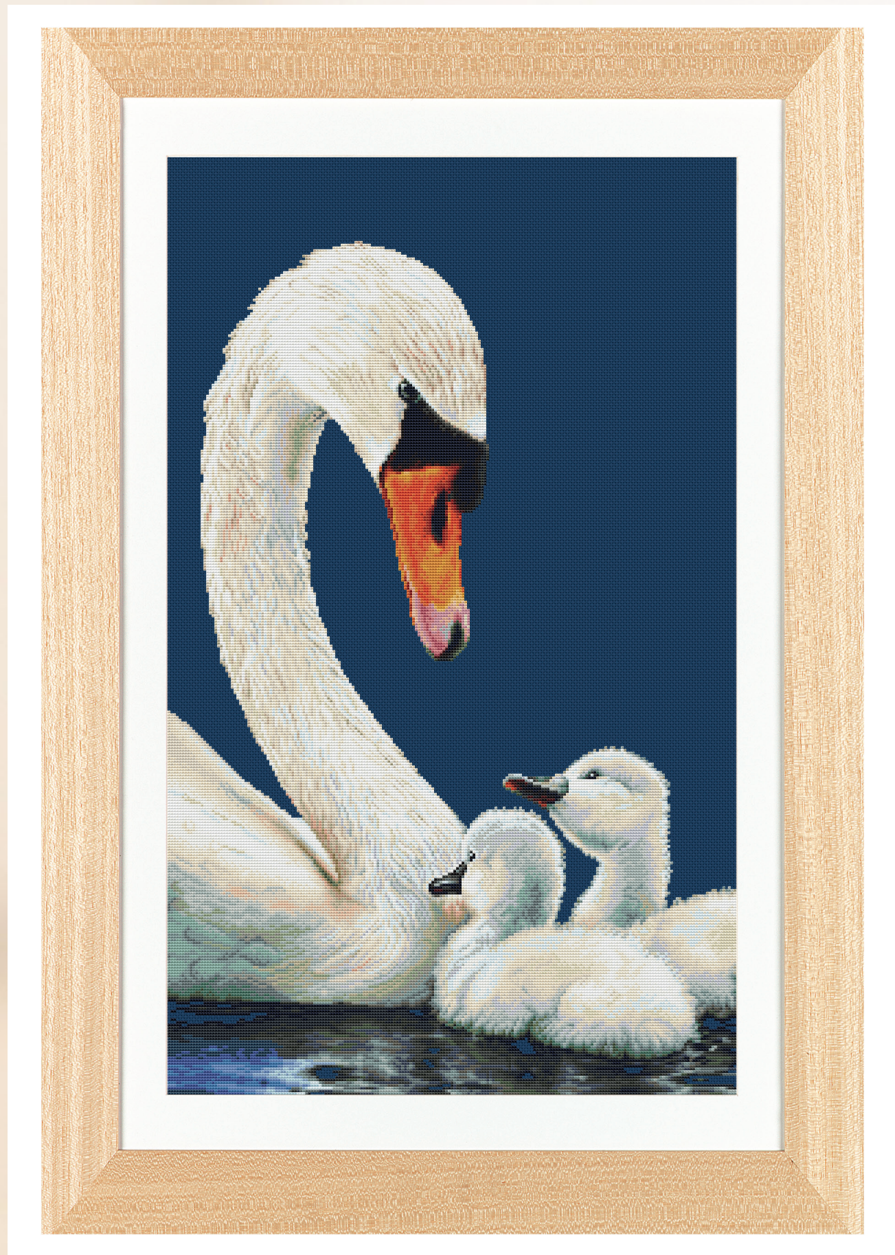
607A 35x53 CM Navy Blue Aida