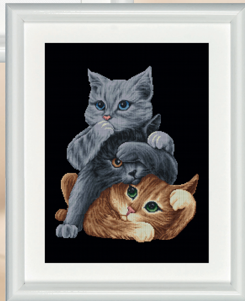
DSB029A 30x35 CM