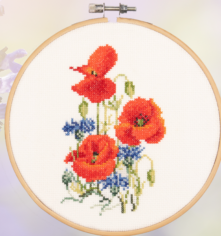
609 Set of 2, 2 Bamboo hoops of 15 CM included