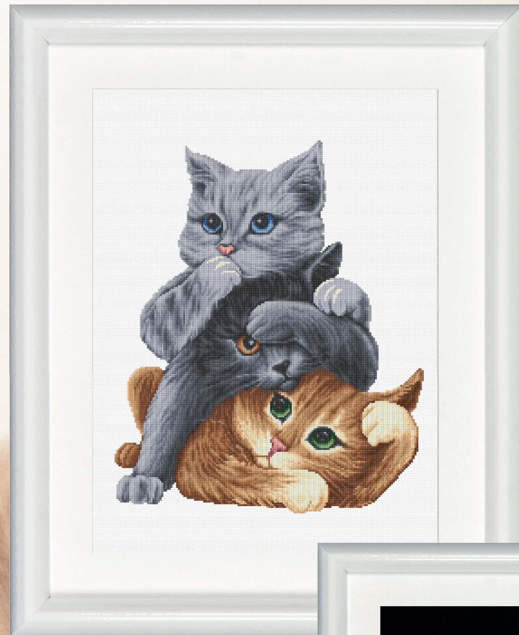
DSB027A 30x35 CM