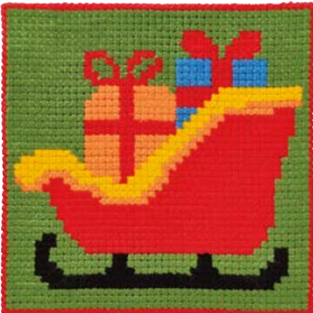
9394 25 x 25 cm