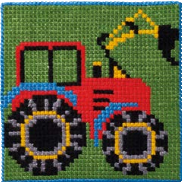
9414 25 x 25 cm