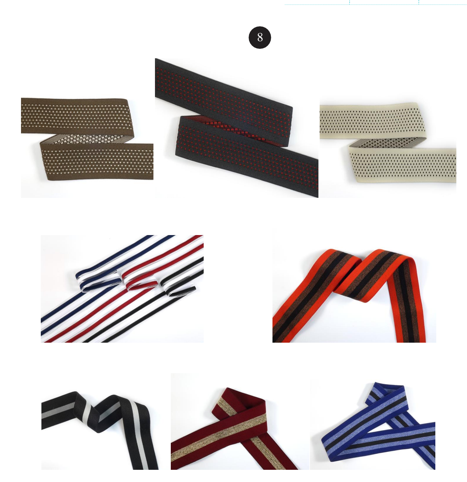
See More Products @ www.matsatextiles.com